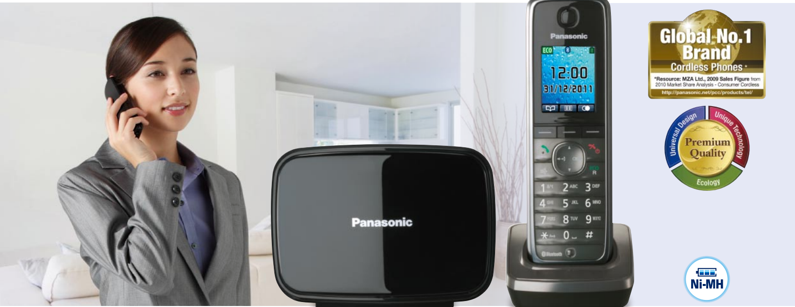
Metallic Gray Photo: Europe Model