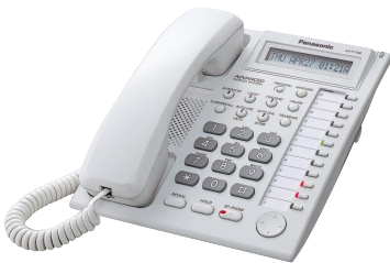
■ KX-T7730 LCD, Speakerphone Unit